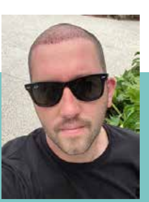
After 1 day