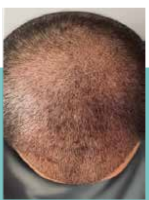
After 1 week